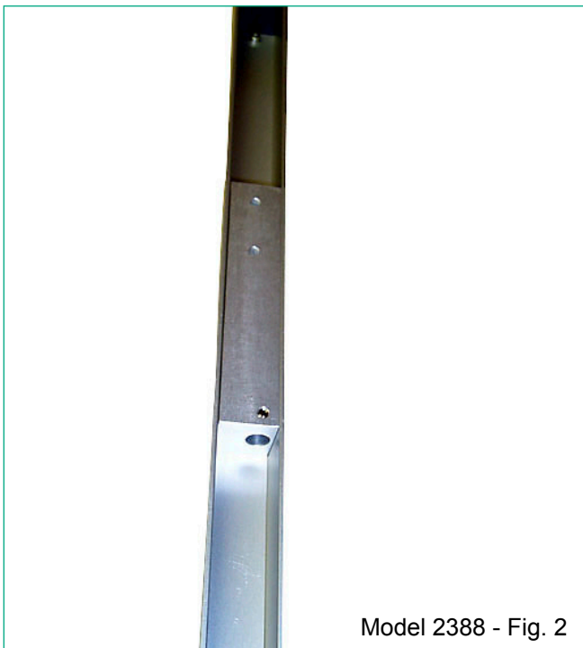
Model 2388 - Fig. 2

The guide rail (figure 1) for small cable diameters can be inserted into an existing clamping device. At the bottom (figure 2) is a 6 mm mounting hole for the temperature sensor 2392-V001.